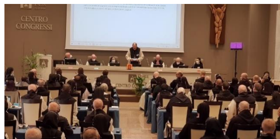
General Abbot Bernardus