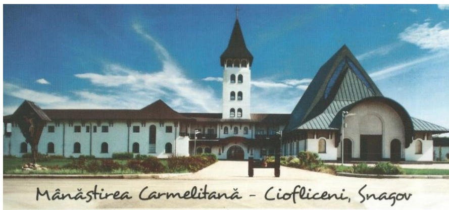
Mănăstirea Carmelitană - Ciofliceni, Snagov

The last activity of the Committee has been the meeting in Moscow on July 3 to 6. We mainly discussed the preparation of the 18th General Assembly which will be held on March 5 to 10, 2018, at the Carmelite Monastery in Snagov (in the area of Ciofliceni) next to Bucharest/Romania under the theme: "Widen the space of your tent" (Is 54.2). It will address the current issues of migration and integration both in the religious communities and in society in general.